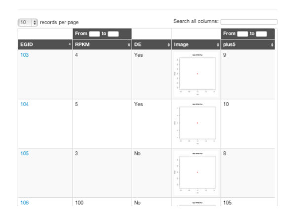
Figure 3: Resulting page created after adding figures and links to table with .modifyDF.